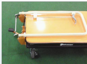
The BX15 handle is collapsible.